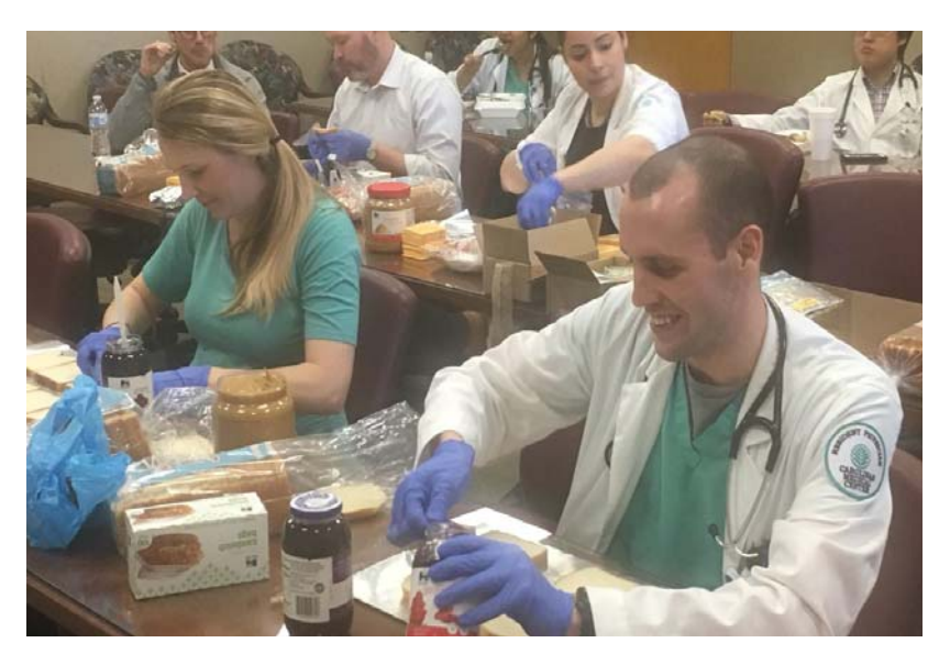
Residents had an opportunity to make sandwiches for Urban Ministries as a part of Internal Medicine Resident Wellness Week.