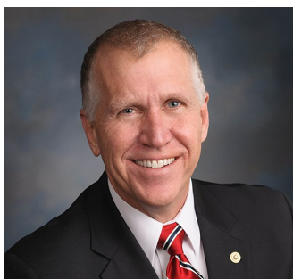
Senator Thom Tillis

Congratulations to all Nursing and Clinical Laboratory Science students graduating on December 18 at Pritchard Memorial Baptist Church, 1117 South Blvd. The awards breakfast will be in the church fellowship hall at 8:30 a.m. followed by rehearsal. The ceremony will be at 3:30 p.m. All are welcome. The College is pleased that the Honorable Thom Tillis, US Senator for North Carolina, will deliver the commencement address.