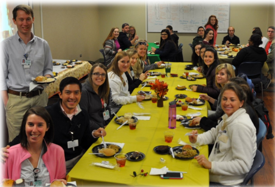
Students enjoying the annual Thanksgiving luncheon....