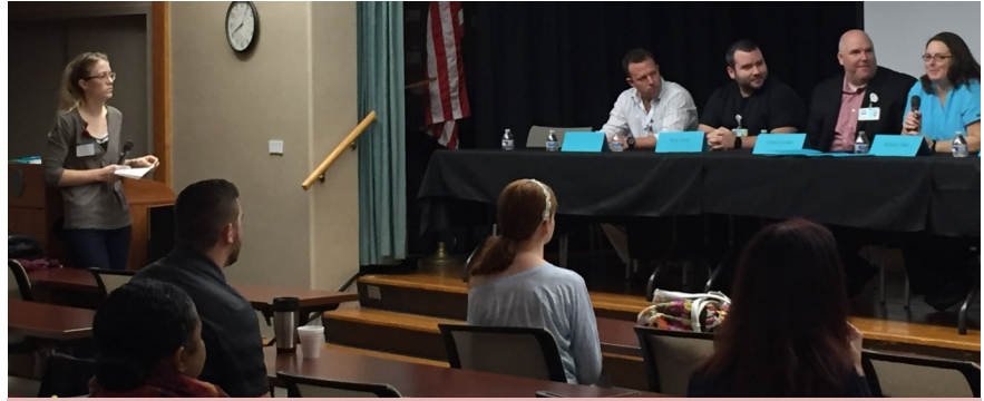
Nurse managers from Carolinas Medical Center participate in a panel discussion.

The nurse manager's panel discussion on November 19 was a great success. Students were able to meet system leaders face to face and discuss measures to put in place now to promote themselves within the system post-graduation. The panel consisted of eleven nurse managers who provided insightful feedback to students wishing to be hired in the system.