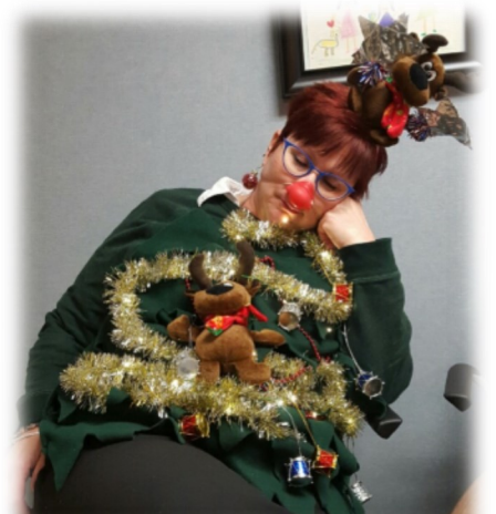
Whew...glad that's done!