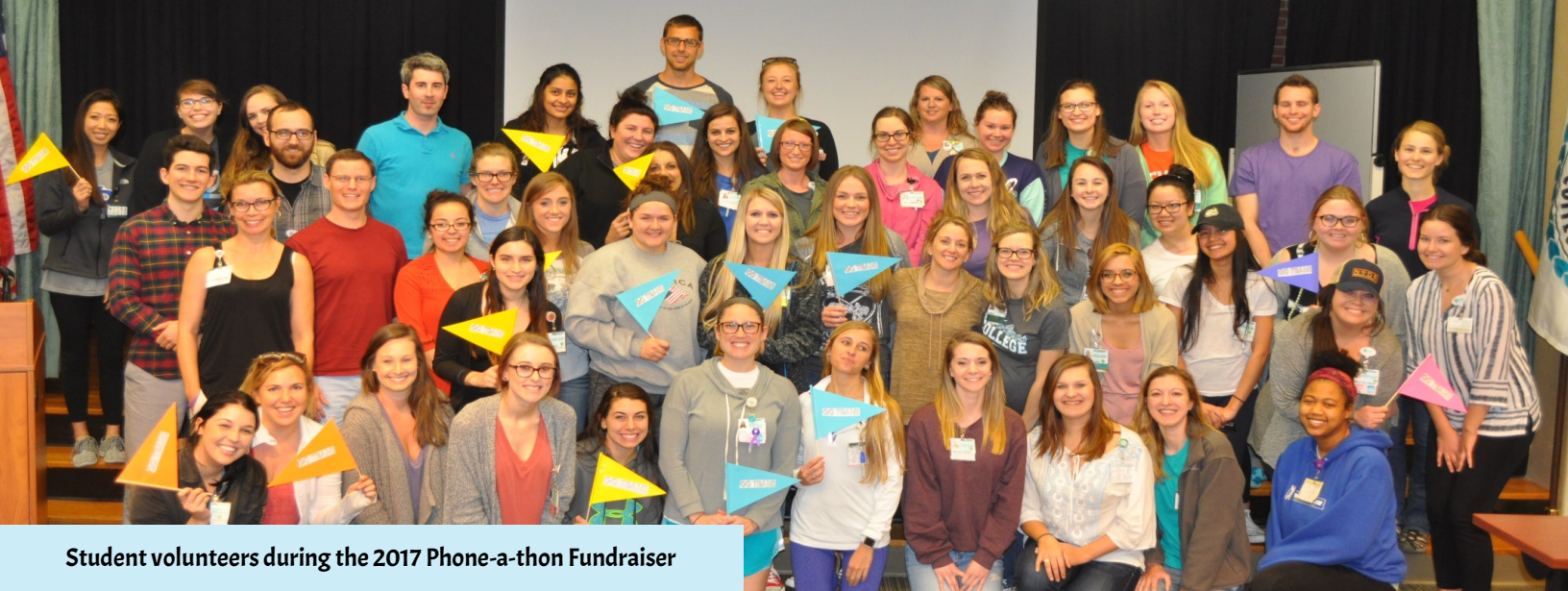
Student volunteers during the 2017 Phone-a-thon Fundraiser