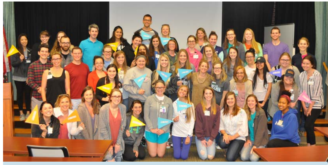
Students who participated in the 2017 Annual Phone-a-thon Fundraiser.

This year's event will take place on November 26, 27 and 28. Your participation is greatly needed and appreciated. Besides, helping the college, participating in a worthy cause, and talking to CCHS alumni, you get free food and a chance to WIN PRIZES! Each night dinner is served at 4:45 pm with a training session starting at 5:15 pm. You will be on the phones from 6:00 pm to 8:30 pm; but don't worry, there is a sweet dessert break to swap stories! Sign-up for one night, two nights, or all three! Each student that signs-up (and shows up) will be entered into a drawing. You get one chance for each day you sign-up/show-up (so... if you sign up for three nights, you get tree chances to win). There will be one winner chosen. Trust us- it's worth it! To sign-up – use the link on the MOODLE page or contact Ruthie Mihal Ruthie.Mihal@AtriumHealth.org