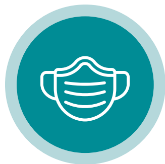
PPE and Medical Supplies

Get access to one of the most comprehensive group purchasing portfolios of its kind to ensure your organization has an available supply of items you'll need to get back in business, including: