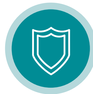
Shield Protectors and Barriers