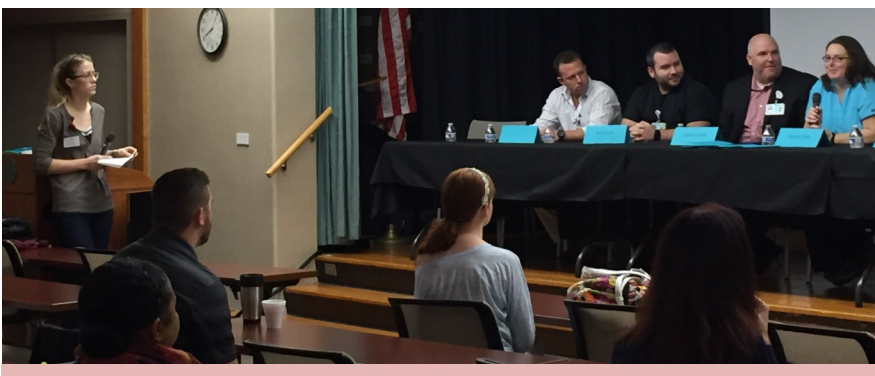
Nurse managers from Carolinas Medical Center participate in a panel discussion.

The nurse manager's panel discussion on November 19 was a great success. Students were able to meet system leaders face to face and discuss measures to put in place now to promote themselves within the system post-graduation. The panel consisted of eleven nurse managers who provided insightful feedback to students wishing to be hired in the system.