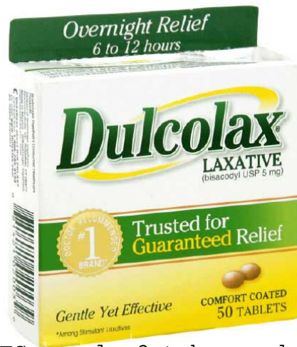
OTC - only 2 tabs needed