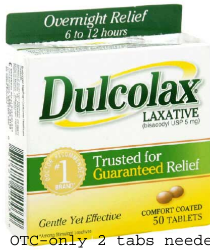
OTC-only 2 tabs needed