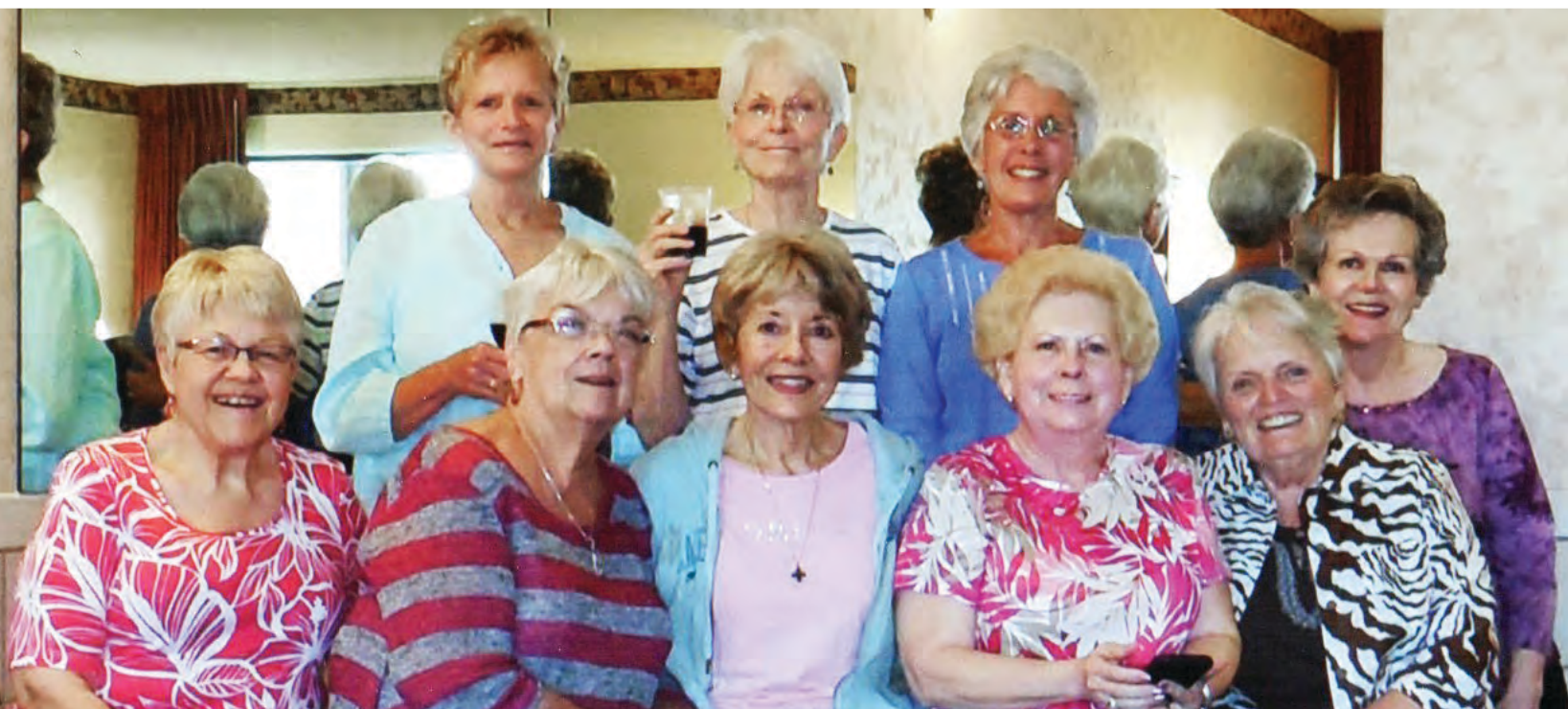
Friends Forever | Class of 1963