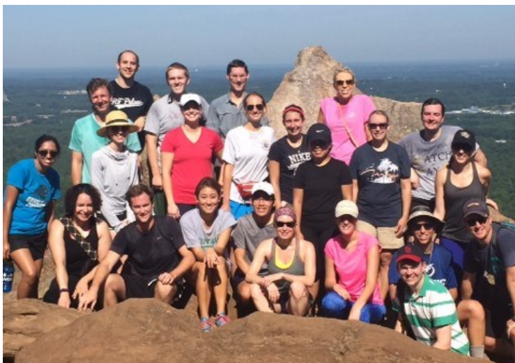
Above: New interns pose for a picture at the top of Crowders Mountain during the annual PGY1 retreat.