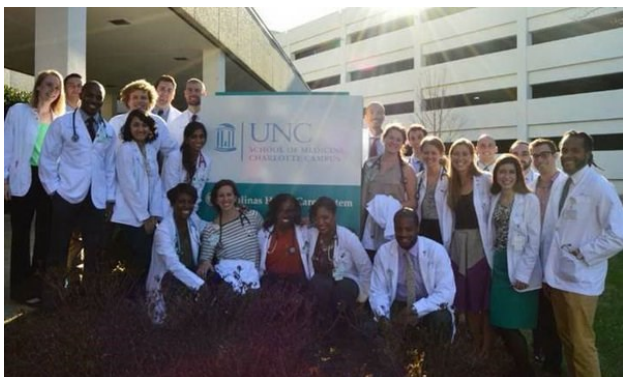
Left: UNC School of Medicine Charlotte Campus medical students pictured on arrival day.

Other highlights of this CLIC curriculum include time in the Emergency Department, including “Pulse” weekends during which time the student follows a patient from the ED through discharge together with a nursing student or an administrative intern. This experience allows the student to learn about transitions of care and provides opportunities for quality improvement through this inter-professional perspective. We also offer a vast selection of fourth year student rotations including acting internships in General Internal Medicine, Cardiology, ID, Pulmonary-Critical Care, Hematology/Oncology, Endocrinology, and other aspects of clinical medicine and research.