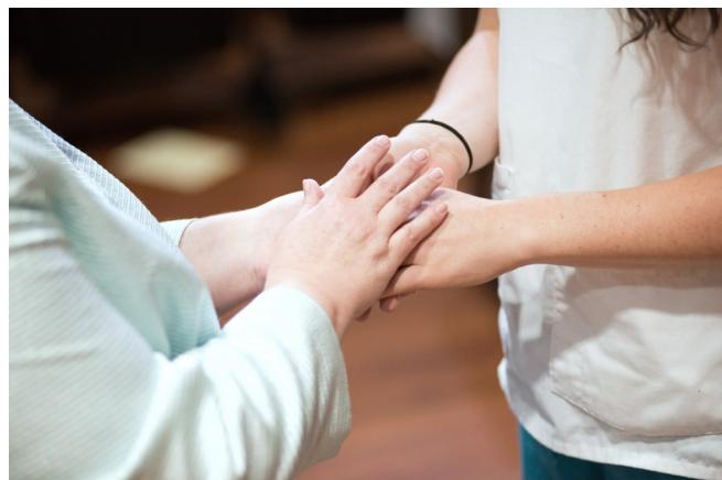
Blessing of Hands