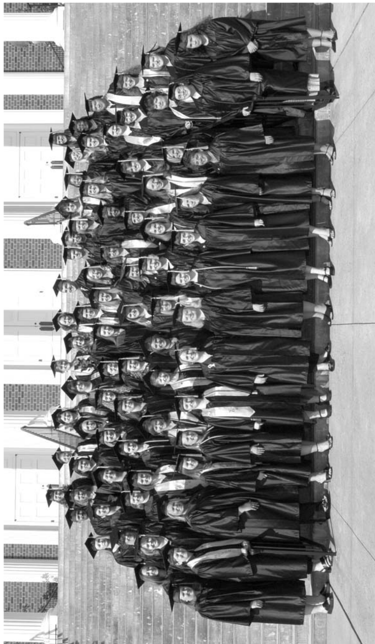
Cabarrus College of Health Sciences Graduation May 2005