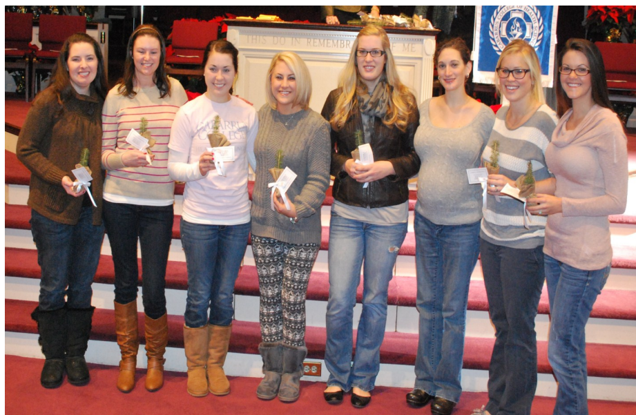
Students line up for a picture after the morning's graduation rehearsal.