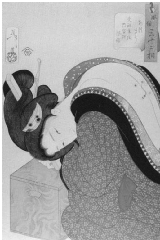
Figure 4. 'Seems Hot' in 'the Customs 32 pieces' (1888) 39 × 26 cm.

During this era, people used to travel to visit shrines and hot-spring cures. One of the most famous poets, Basho Matsuo, wrote in his travel diary, The Narrow Road to the Deep North about applying moxa during his travel. Moxa and the incense stick were the traveler's indispensable items (16). A rare Ukiyoe (Fig. 5) shows a woman holding her child between her knees and applying moxa as part of moxibustion therapy. This shows how people applied moxa to their children for prevention of diseases and to promote healthy growth.