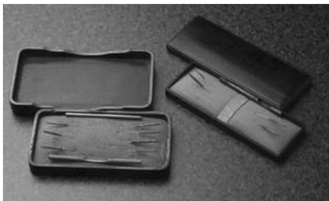
Figure 3. 'Edo's Filiform Needle and Needle Box' 4 × 11.5, 6 × 11 cm. [Source: Mori H, Nagano H. Harikyu Museum (Museum of Traditional Medicine), Vol. 2. Publishing Department at Morinomiya College of Medical Arts and Sciences, 2003.]

in 1676. He introduced the Japanese word, moxa, in his book. This word, moxa, which is derived from mogusa , has its root in almost all European languages (14).