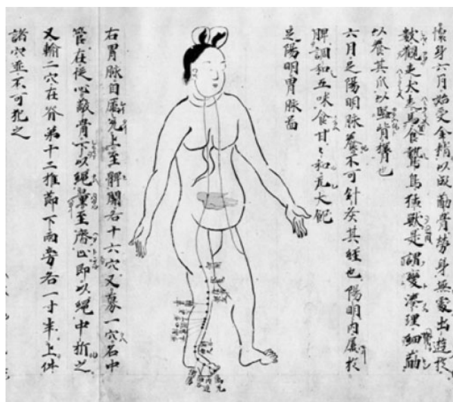
Figure 1. 'Ishinpo' (replica).

As soon as the Heian period began, exchange with the Tang dynasty (China) was activated, and aristocrats (doctors or well-educated people) who could travel to China brought high-grade information and current medical books to Japan. As a result, Tang medicine began to take root in Japan, until 894 when exchange with China stopped and Japanese physicians gradually reverted back to the original Japanese medicine.