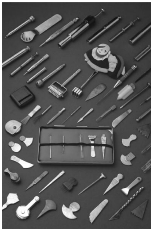
Figure 8. ‘Modern and present-day pediatric acupuncture needle’

During 1936, there was a revival of Chinese medicine (Oriental medicine) advocating whole-body treatment that was used most importantly to treat the underlying causes of disease. Meridian therapy was also originated as an acupuncture therapy based on a theory from the classic book, nangyo ( nan jing ) (1st century AD). It gave