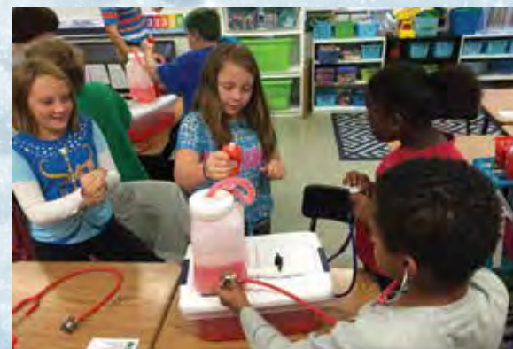
Students get hands-on experience learning how hard their hearts work pumping blood through their system and why it's important to keep your heart healthy in a recent “Passport to Fitness” program, funded with your donations to the Foundation.

health expo, scholarships for low income individuals to attend health management classes, health appraisals, screenings, two “Wellness Wagons” for community outreach, and more. Your gifts make a direct impact on funding these programs that reach out across all age groups to help individuals live healthier lives.