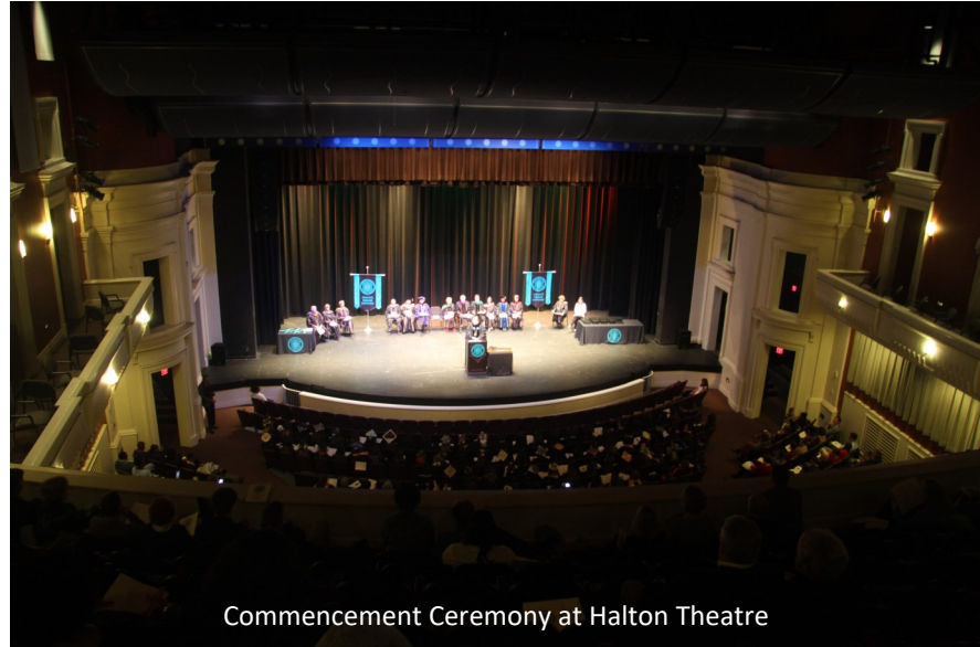
Commencement Ceremony at Halton Theatre