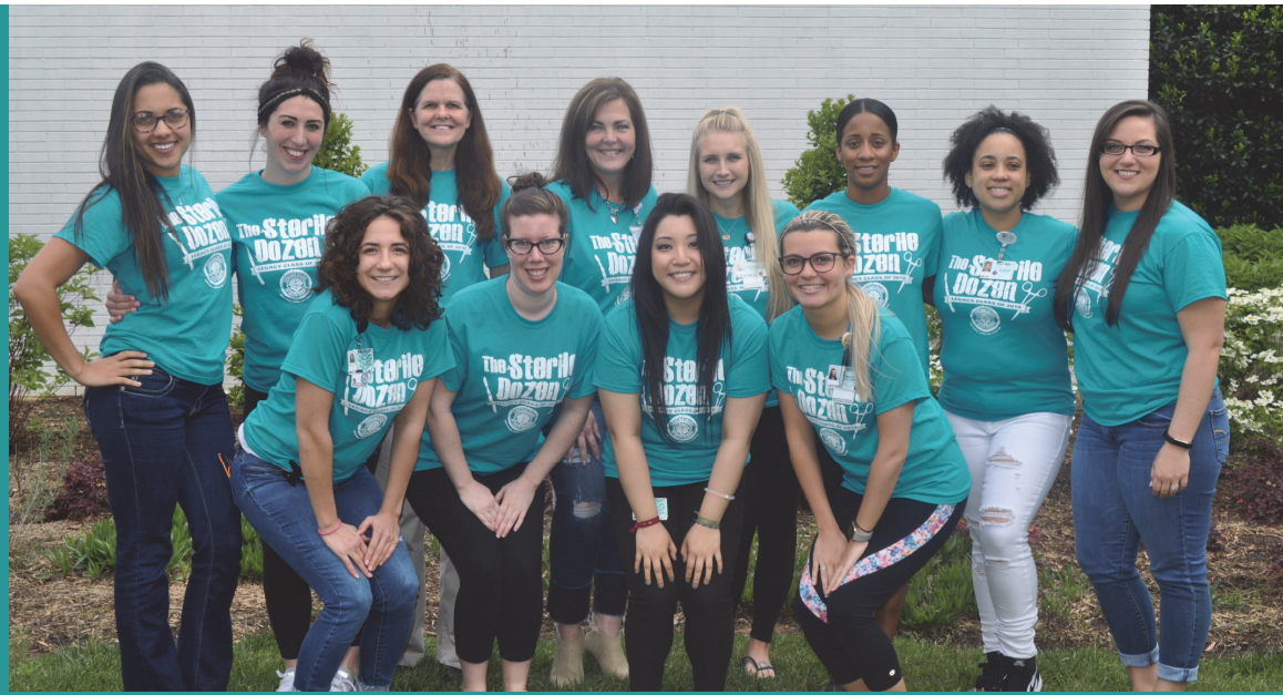
Surgical technology students, Class of 2018.

CCHS Hours of Operation Monday to Friday 7:30 AM to 4:30 PM Badge access: 24/7