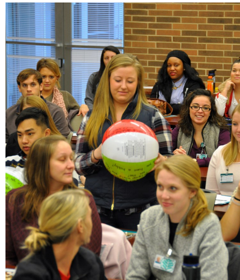
Students participate in an orientation week ice breaker.

National Surgical Technologist Week: To promote the profession and educate the community about the vital role that surgical technologists play in the operating room.