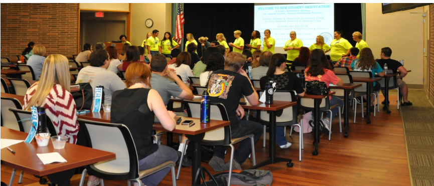
Student Ambassadors welcome new students to the college.