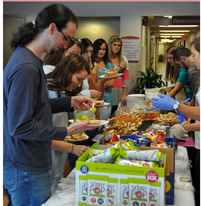
New nursing students were treated to lunch by the CCHS Student Nurses Association.